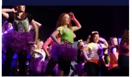
After 8 months of hard work and preparation we finally were able to showcase the talents of our students in the musical "Back to the 80's". We hope we have given those students involved, a high school memory that they will never forget. <u>READ MORE ></u>